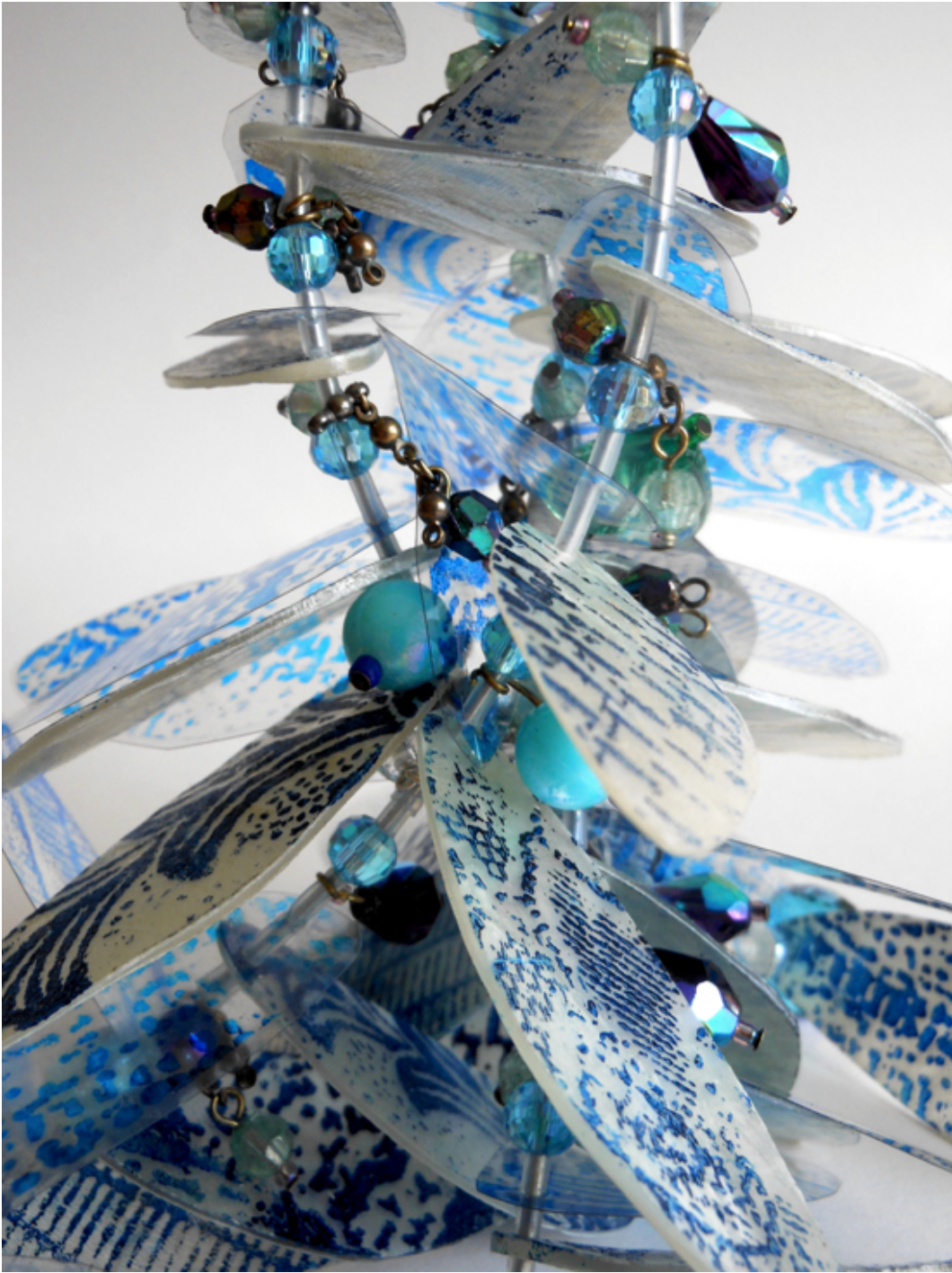
Detail of small sculpture