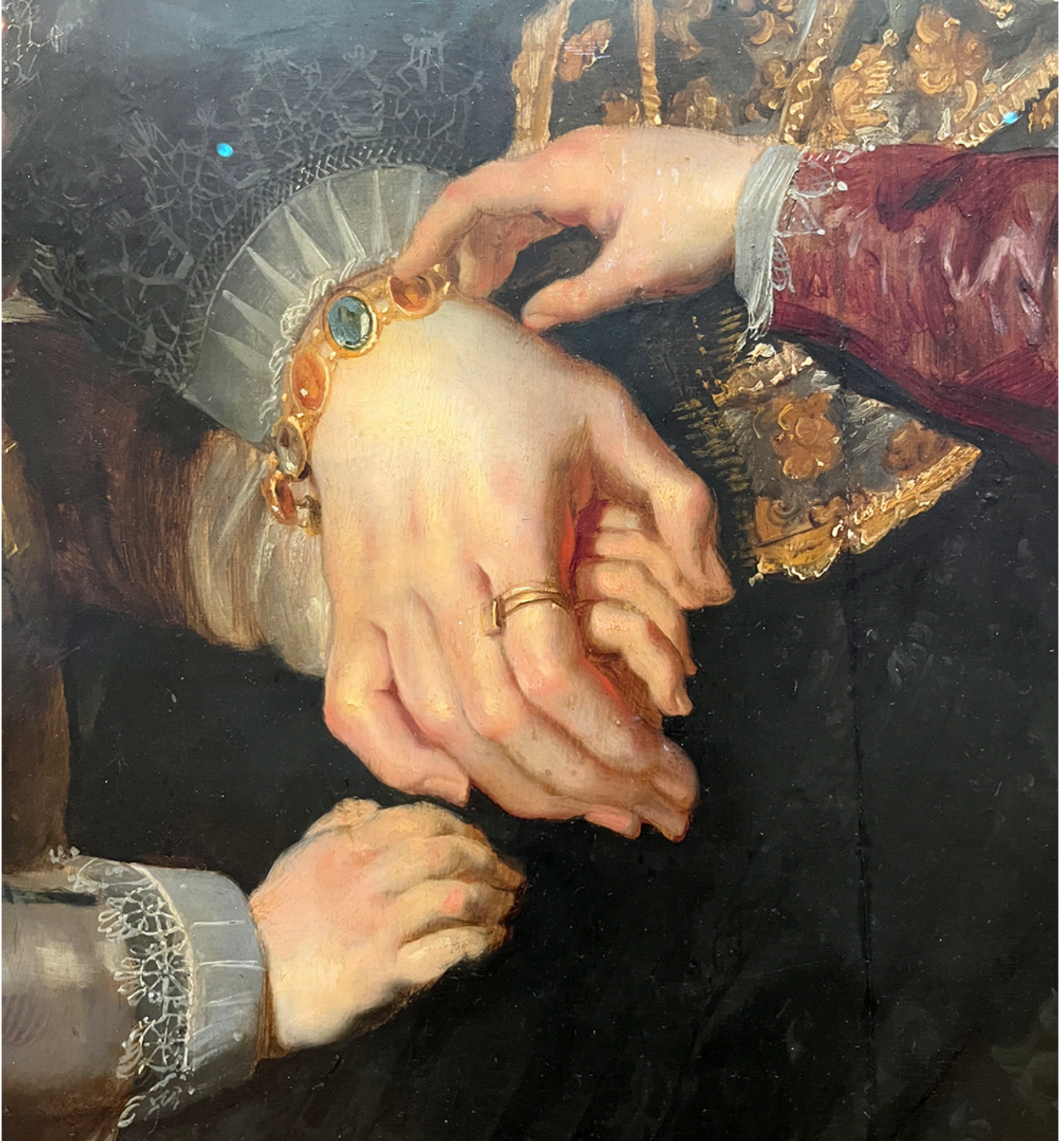
Portrait of Jan Brueghel I (1568-1625) and his family, by Peter Paul Rubens (Detail)