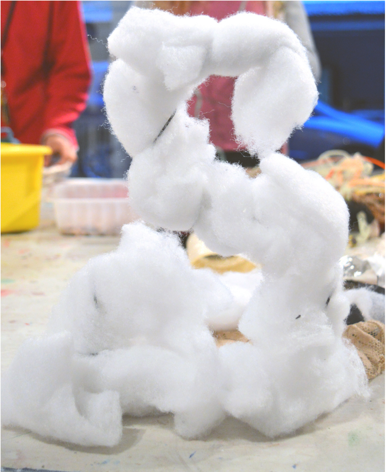
'S' for Sheila