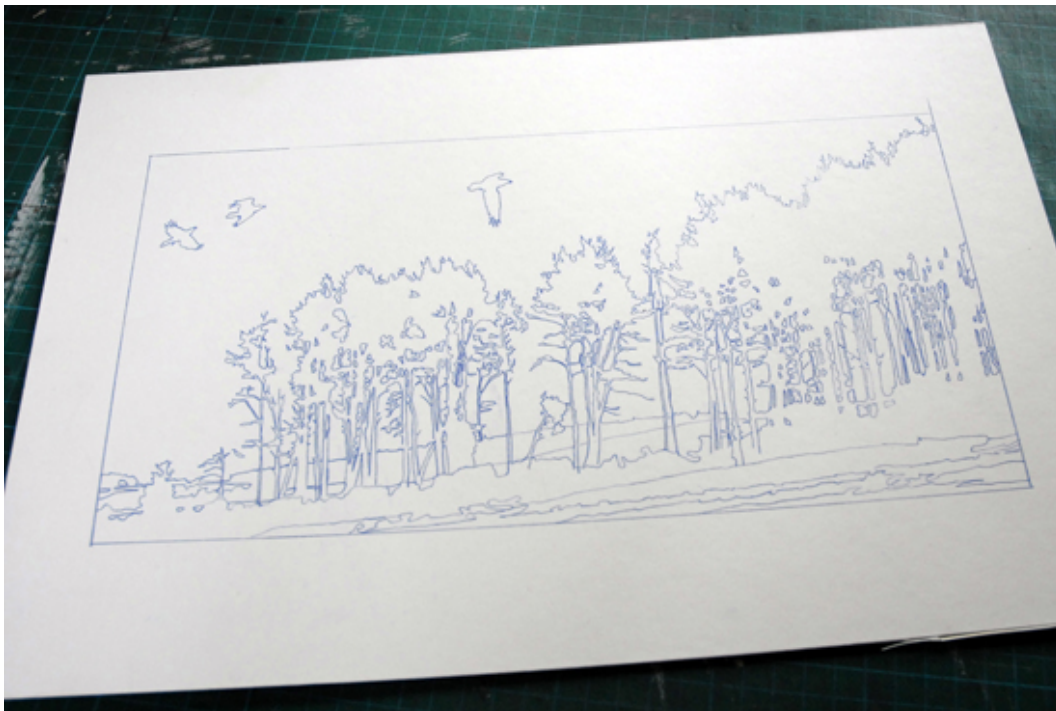
Image transferred to mountboard plate

For the plate I use mountboard. The image, which has been reversed so the resulting print will be the correct way round, is transferred using carbon or tracing paper.