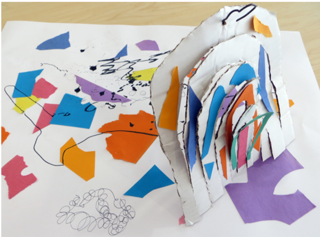
Sculpture Inspired by Joan Miro

AccessArt was pleased to work with Network CB23 Primary Schools at a Spanish Day at Cambourne Village College , Cambridgeshire. Year 5 pupils worked in a variety of materials inspired by the work of artist Joan Miro .