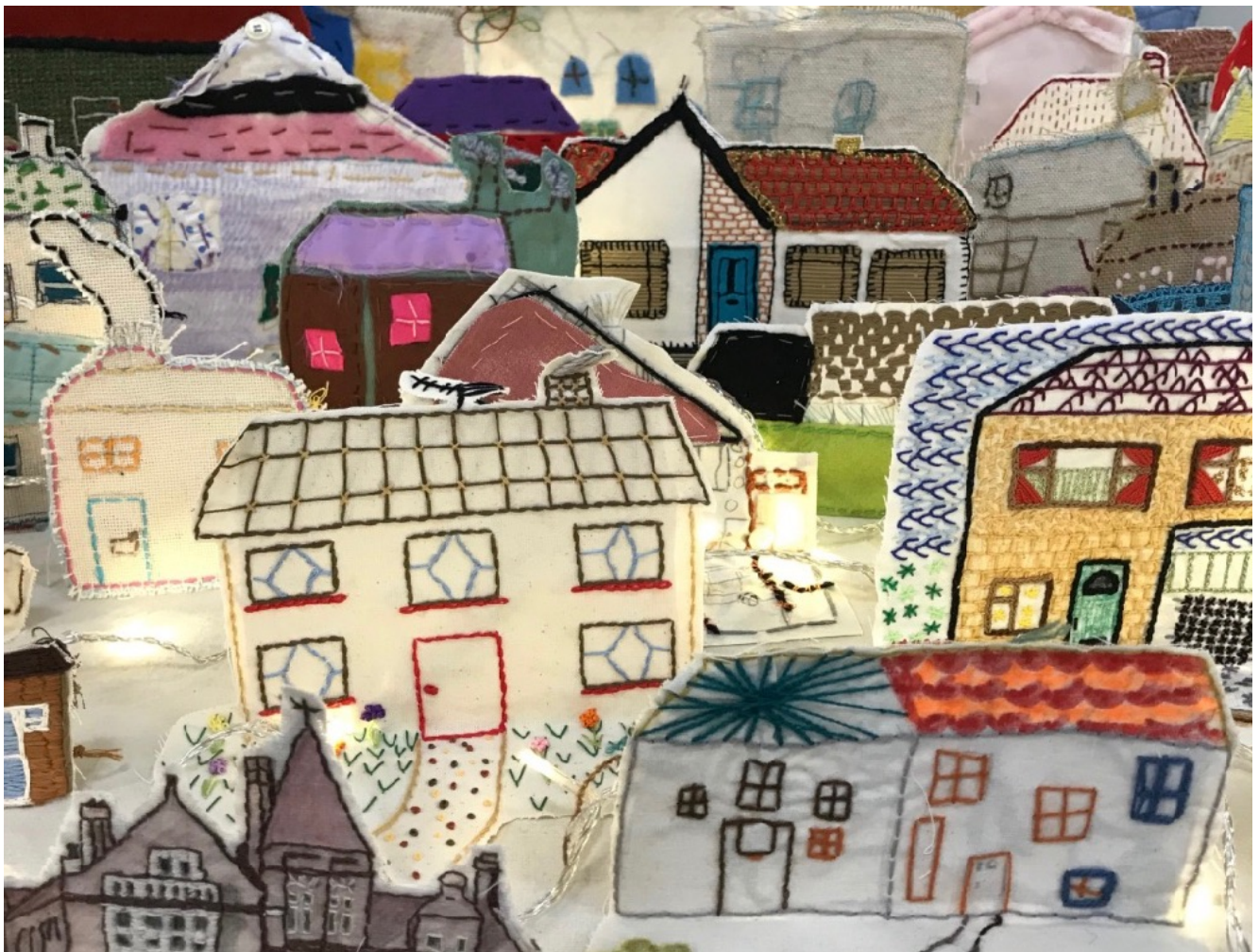
The AccessArt Village at Mansfield Central Library in November and December 2017

You can read more about the AccessArt Village here , but this is the story of one group of children, who generously contributed to the project, and then got a chance to see their work on show, locally to them, in Mansfield Central Library. The pupils stitched work can be seen, in and amongst contributions from all over the country, at Mansfield Central Library until the end of December 2017.