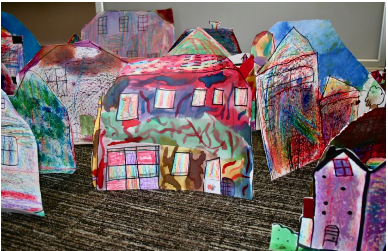
Collection of Inky, waxy houses by pupils of Berry Hill Primary School