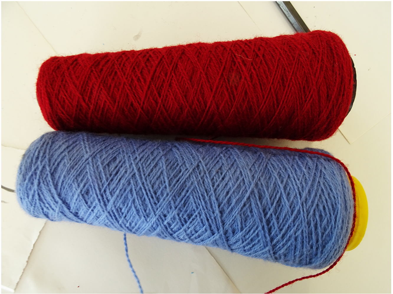
Cones of wool