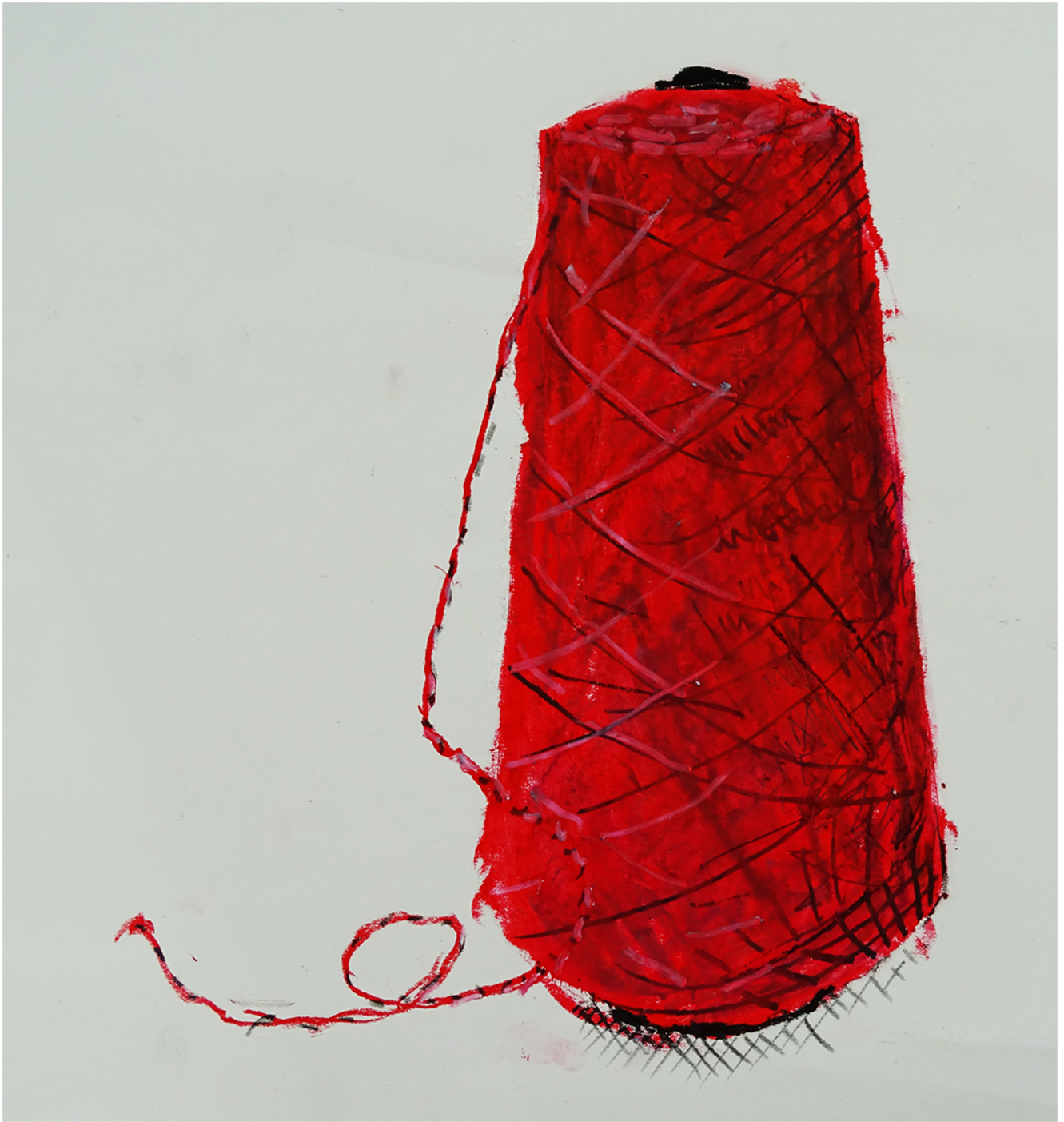
Oil pastel and charcoal woollen cone