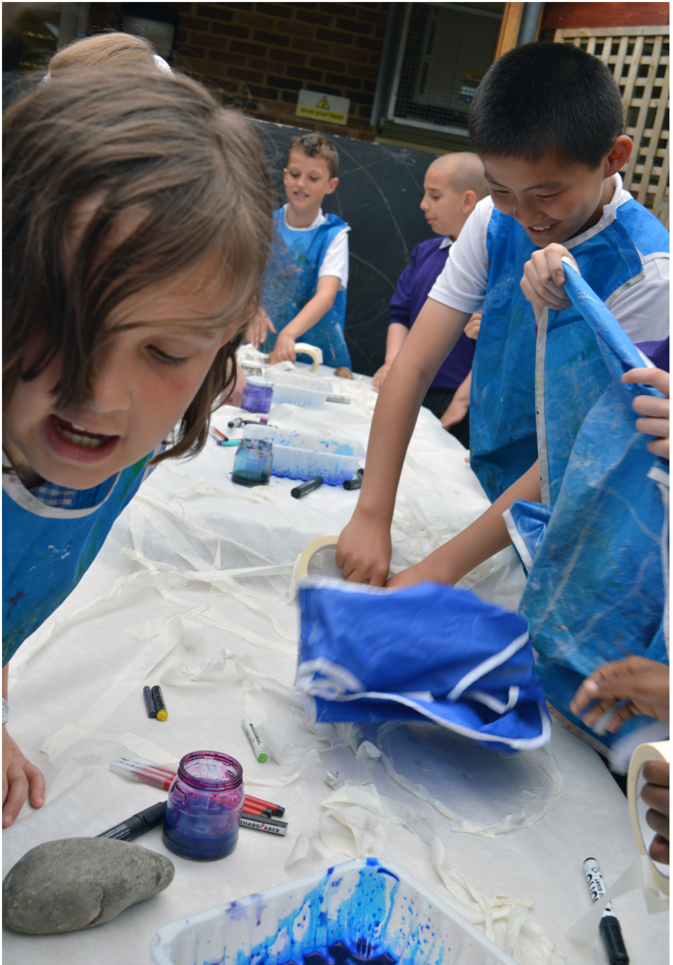
Initially children worked with masking tape, sticking long