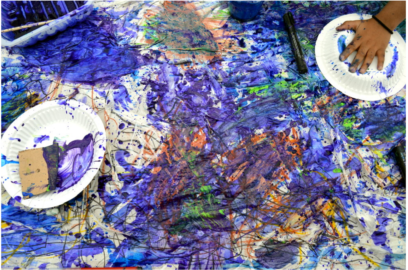
Layers of paint over masking tape, oil pastel and permanent marker