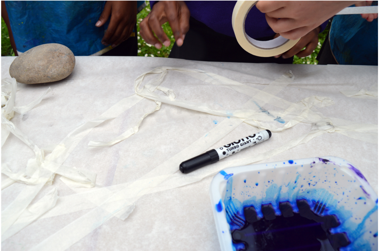
Detail of masking tape - pupils enjoyed working together