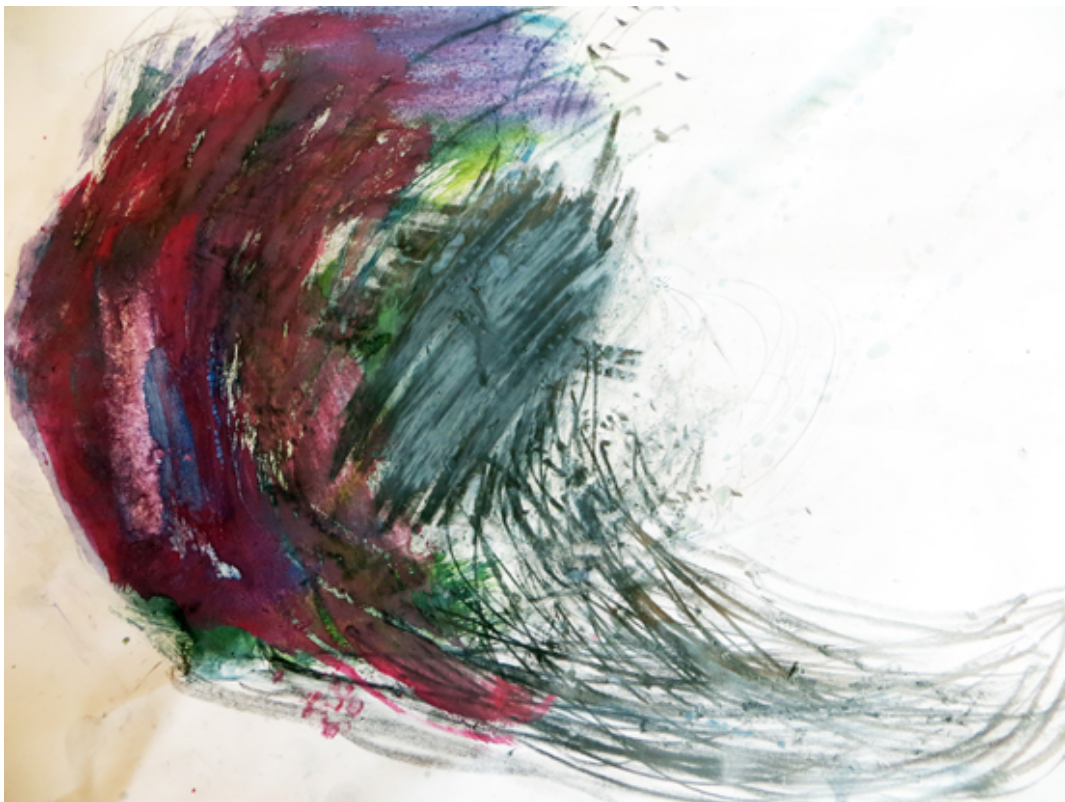
Painting the Storm

The following project shares the journey and outcome of a weather-inspired exploration of watercolour and graphite, with Year 5 and 6 pupils (ages 9, 10 and 11) at Bourn Primary Academy , Cambridgeshire.