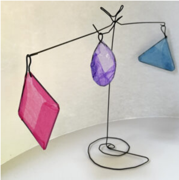
Heavy/Light Mobile – Drawing and Making