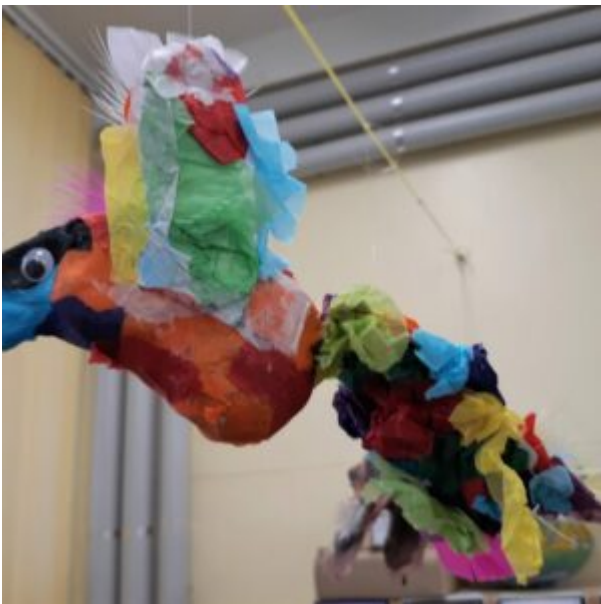
Visual Arts Planning: Birds