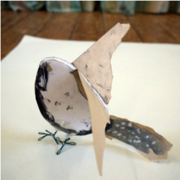
Flying Minpin Birds