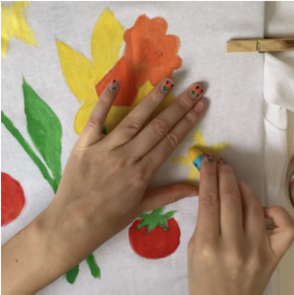
Autumn Floor Textiles