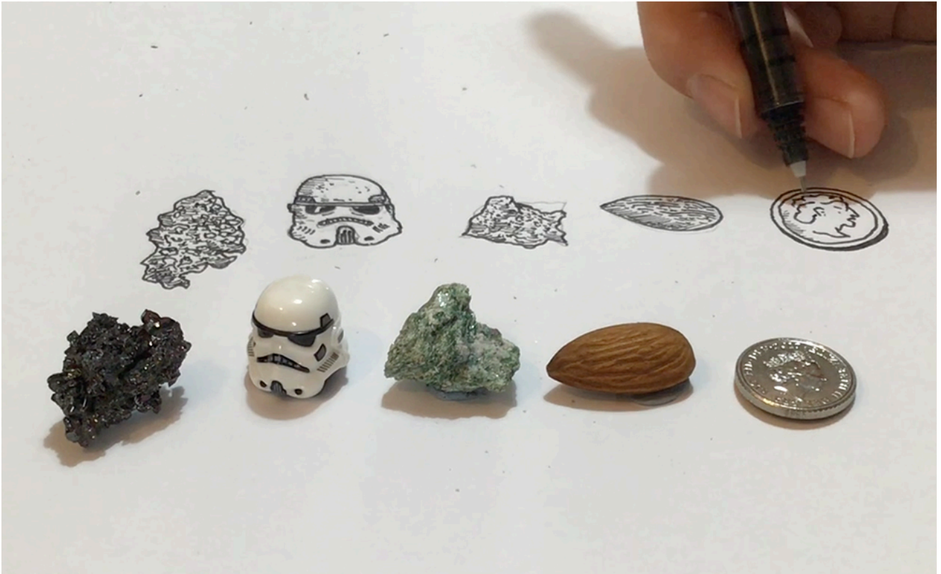
Small drawing by Zak

This is a sample of a resource created by UK Charity AccessArt. We have over 1500 resources to help develop and inspire your creative thinking, practice and teaching.