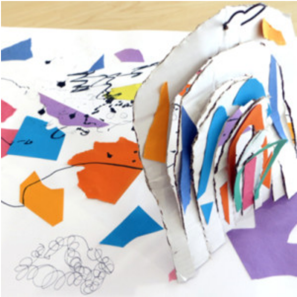
a cheerful orchestra