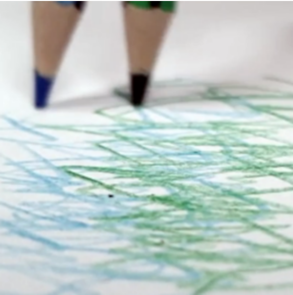
Painting the storm