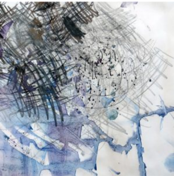
Drawing to a metronome