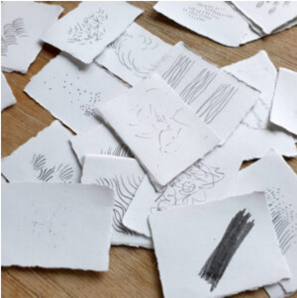
thoughtful mark making