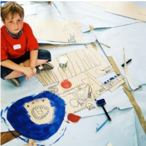
Sketchbooks and Performance