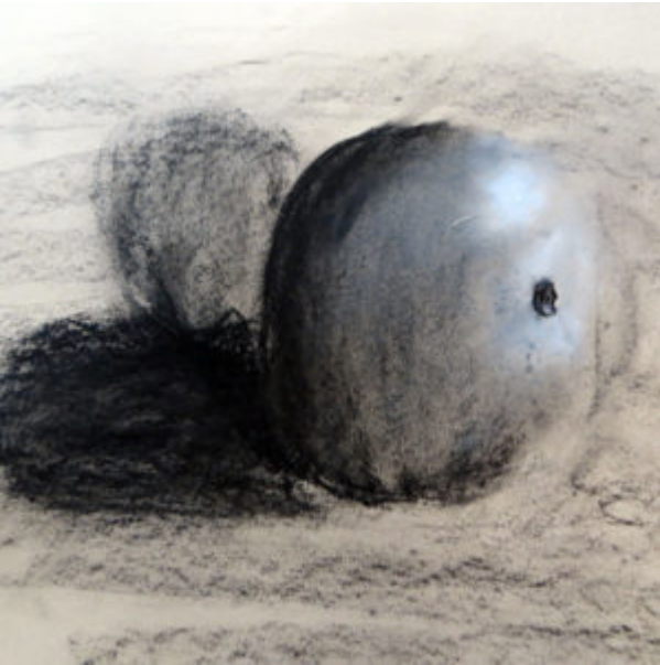
Drawing by torchlight