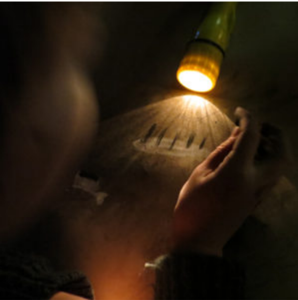
See Three Shapes