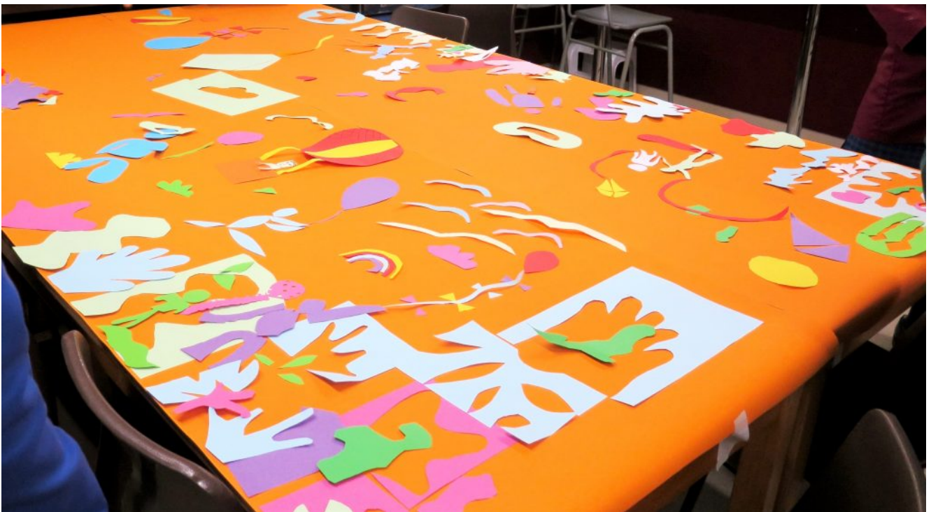
Collaboratively creating composition ideas