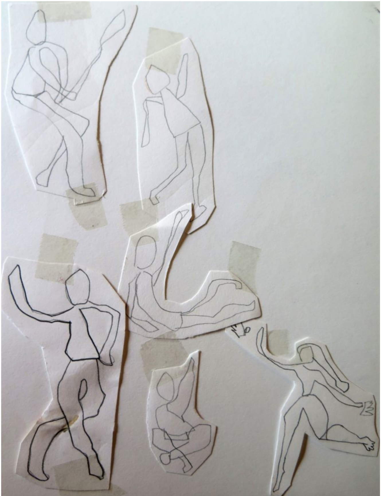
Drawing with continuous lines