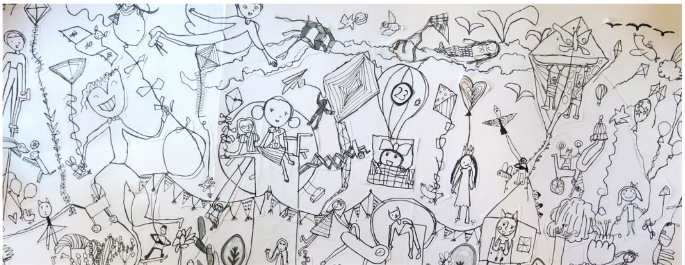
A collage of some year 3 drawings