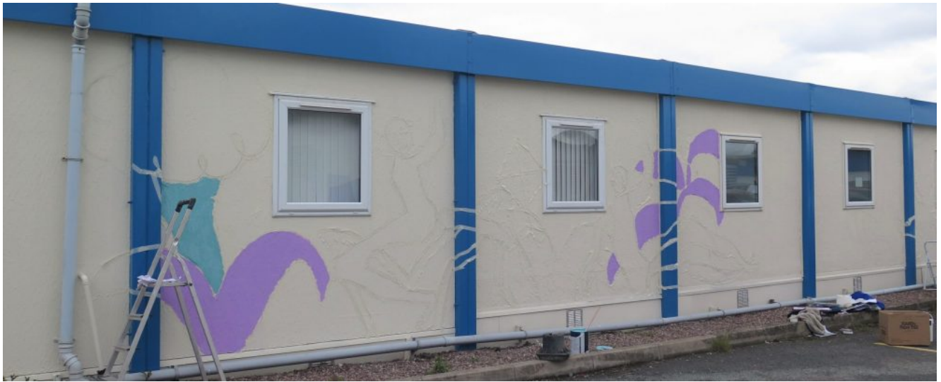
Taping the designs - the beginnings

We had continual encouragement from any passers-by. It developed quickly each time we stood back to view the advancement, we planned the next stage.