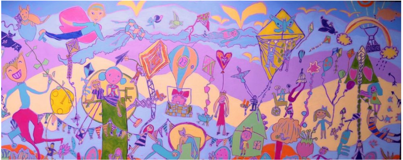
The final 1.3 metre painting for the foyer.

The seniors were tasked with the bigger challenge - designing and painting the outside of the building. They decided upon a big, bold design, accounting for any visually impaired children using the centre. Inspired by a visit to a local exhibition of Matisse's paper cut-outs of plants and figures, pupils used marker pens to draw outlines of moving bodies using one continuous line. They drew from observation of each other with some using computer drawing software to create their simple shaped figures. Inspired by photographs of an aging Matisse when he was almost blind and making his cut-outs from his wheelchair, we too mixed vibrant colours and painted papers. He famously described the technique of directly cutting figures with scissors as 'drawing with scissors'. Twisted and contorted figure shapes interacted with sitting and acrobatic poses. All the elements that usually worry pupils about figure drawing were disregarded – proportion, symmetry, capturing a likeness, measuring and the dreaded 'fingers'.