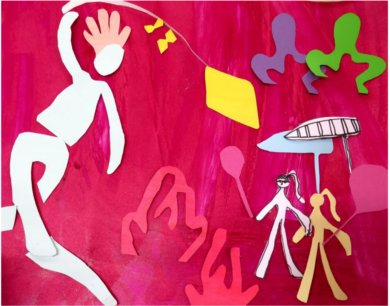
'Drawing with scissors' in the style of Matisse.