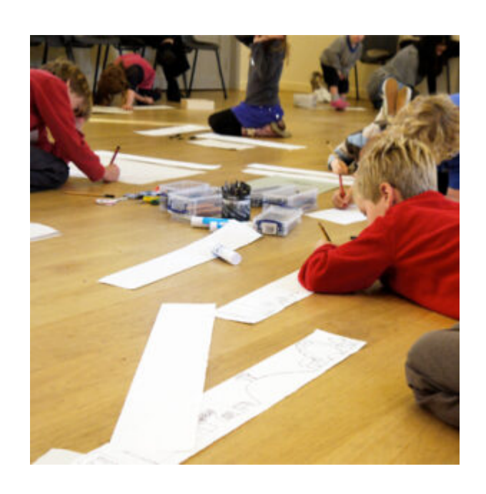
Responding to Place