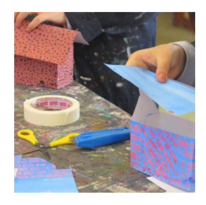
One Line Street