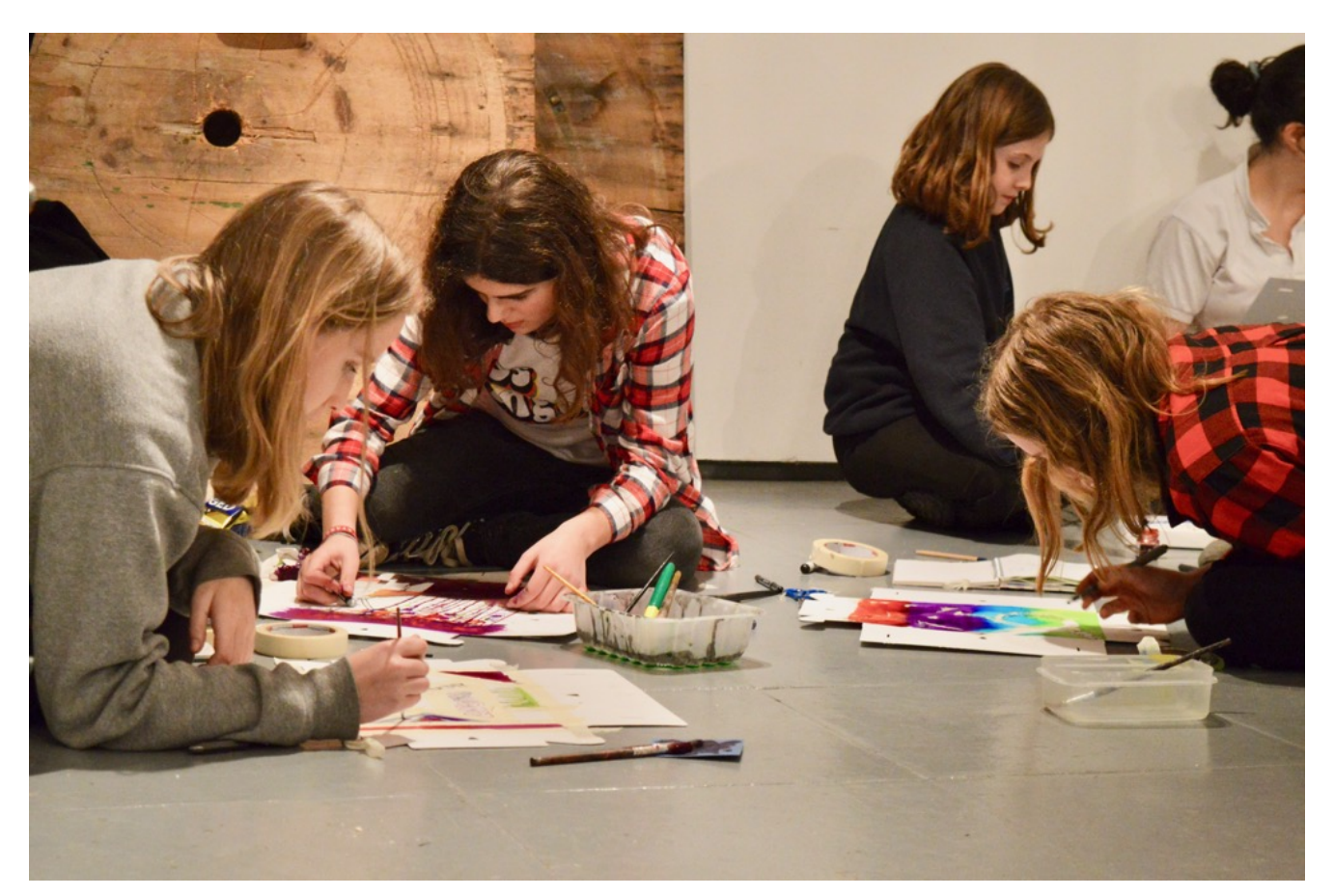
Schools, Colleges, Arts Organisations: Single and Multi-Users From £42

AccessArt is a UK Charity and we believe everyone has the right to be creative. AccessArt provides inspiration to help us all reach our creative potential.