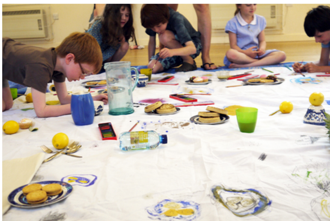
Drawing the picnic!

After 4 weeks of drawing vegetables and with the end of term upon us, I thought the children in my Drawing Workshop for Ages 6 to 10 deserved a sweet treat. At the end of each previous half term we worked on a communal drawing - which made a nice focus for a session. What better on a hot summer's evening to draw a picnic? (And then eat it!).