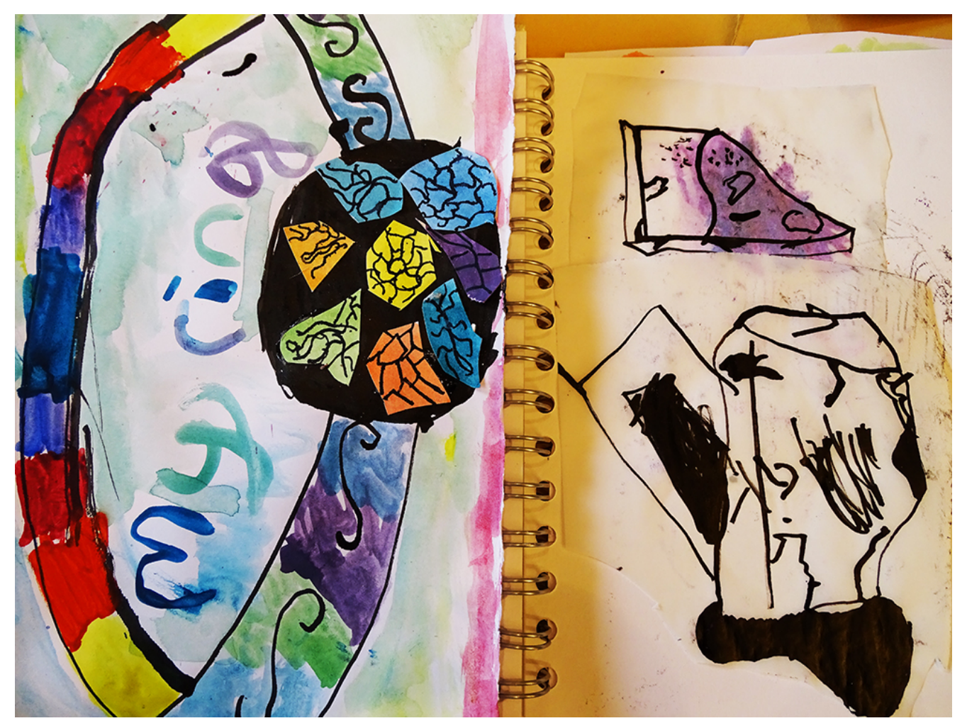
Pink Pig sketchbook exploration

Following on from Drawing with a Ruler , this post shares how children aged 8, 9 and 10 attending an AccessArt Mini Art School developed a body of work in their <u>Pink Pig Sketchbooks</u>.