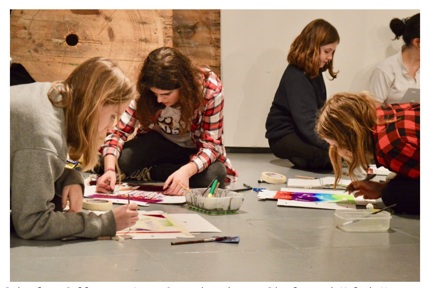
Schools, Colleges, Arts Organisations: Single and Multi-Users From £42

AccessArt is a UK Charity and we believe everyone has the right to be creative. AccessArt provides inspiration to help us all reach our creative potential.