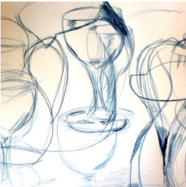
Drawing with Straight Lines