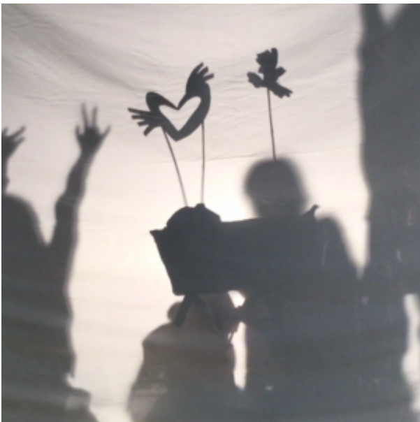
shadow puppets and whiteboards