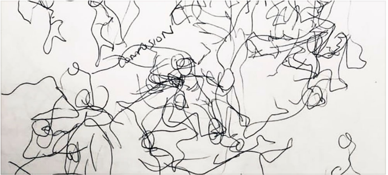
Drawing dancers by Tobi Meuwissen

Choose stills from the video above, drawing them in panels (rectangles), to create a sequence of drawings