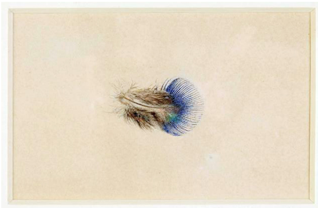
Peacock Feather by John Ruskin. Collection of the Guild of St George, Museums Sheffield

The image below of a Peacock Feather drawn by John Ruskin inspired the workshop - I used to visit the Ruskin Gallery in Sheffield. His drawn feather is small but it draws you in.