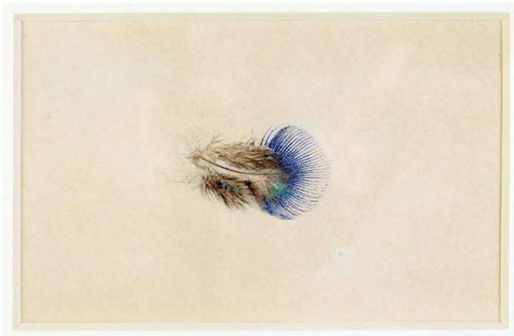
Peacock Feather by John Ruskin. Collection of the Guild of St George, Museums Sheffield

The image below of a Peacock Feather drawn by John Ruskin inspired the workshop - I used to visit the Ruskin Gallery in Sheffield. His drawn feather is small but it draws you in.