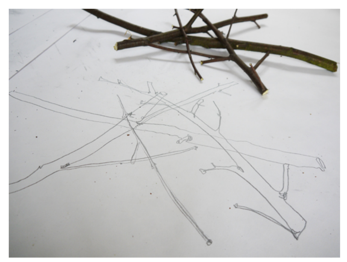
Continuous Line Drawing of a Structure

In contrast to the potential chaos of drawing moving water, in this exercise you are going to first build a structure, which you then draw. Just as you built your knowledge by observing the moving water before you began to draw, in this assignment you are going to build your knowledge of the structure by taking an active part in making it, before you put that knowledge to good use when you make your drawing.