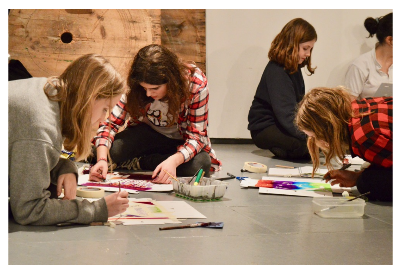
Schools, Colleges, Arts Organisations: Single and Multi-Users From £42

AccessArt is a UK Charity and we believe everyone has the right to be creative. AccessArt provides inspiration to help us all reach our creative potential.