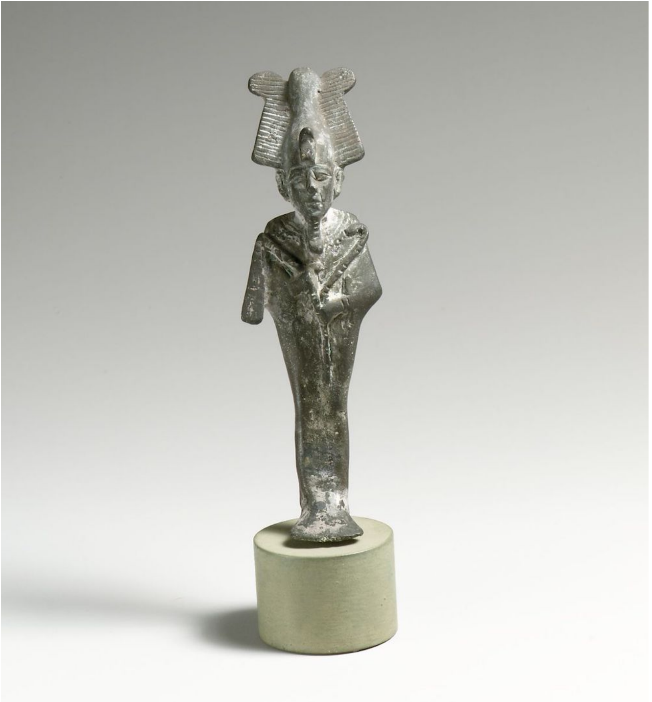
Bronze statuette of Osiris, Late Dynastic-Hellenistic 664–31 B.C. Egyptian Medium: Bronze Dimensions: H. 4 1/2 in. (11.4 cm) The Cesnola Collection, 1874–76