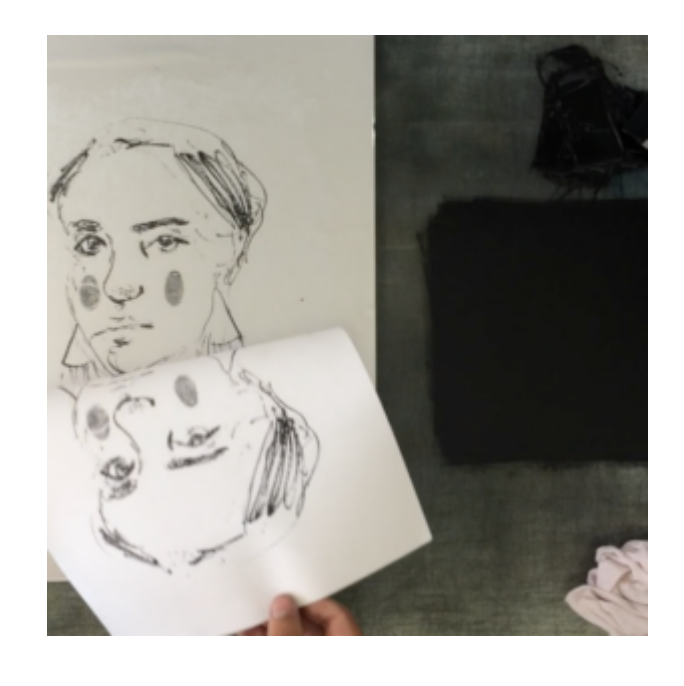
video enabled printmaking resources