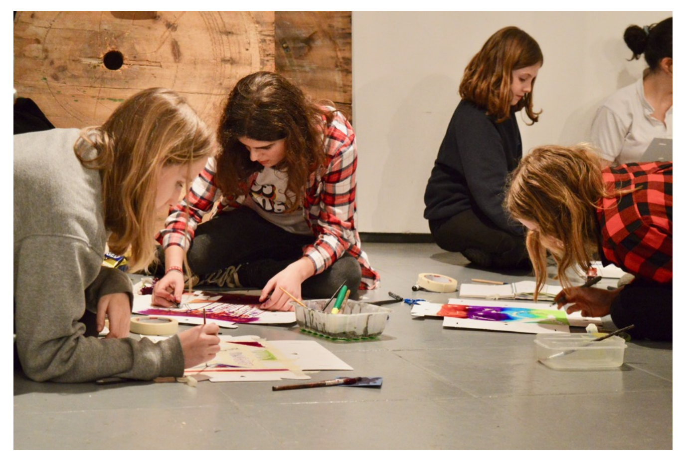
Schools, Colleges, Arts Organisations: Single and Multi-Users From £42

AccessArt is a UK Charity and we believe everyone has the right to be creative. AccessArt provides inspiration to help us all reach our creative potential.