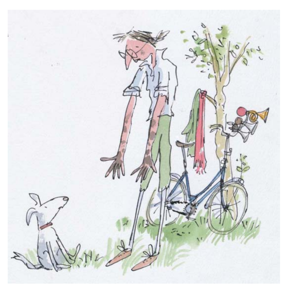
Image (c) Quentin Blake, 1987 from 'Mrs Armitage on Wheels' (published by Jonathan Cape)