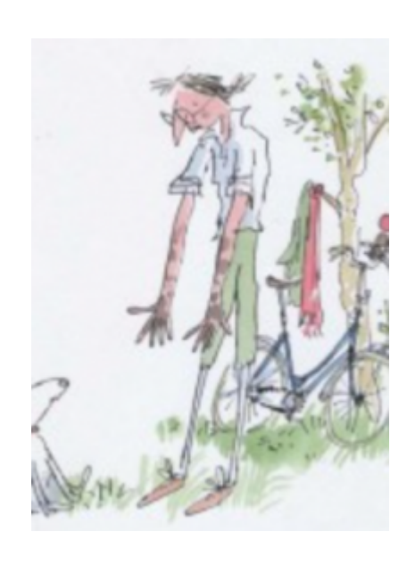
Ages 7 to 8 Year Four