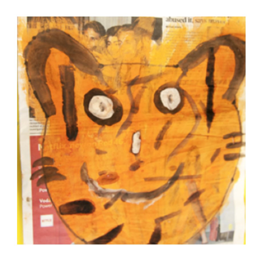
Download the Powerpoint Version