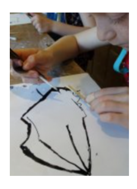
Ages 9 to 10 Year Six