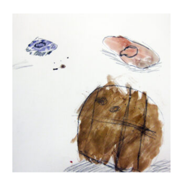
This is featured in the 'Exploring Form Through Drawing' pathway