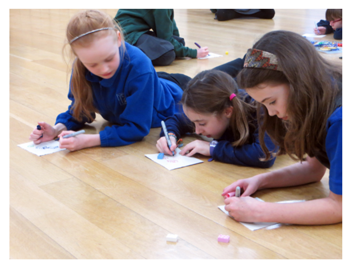
Children began by attempting to make drawings of single Lego blocks...

Children were asked to make simple small drawings of single Lego blocks. We talked briefly about perspective and viewpoint: how if you lie down on the floor and view a piece of Lego you can angle it so that you can see three sides.