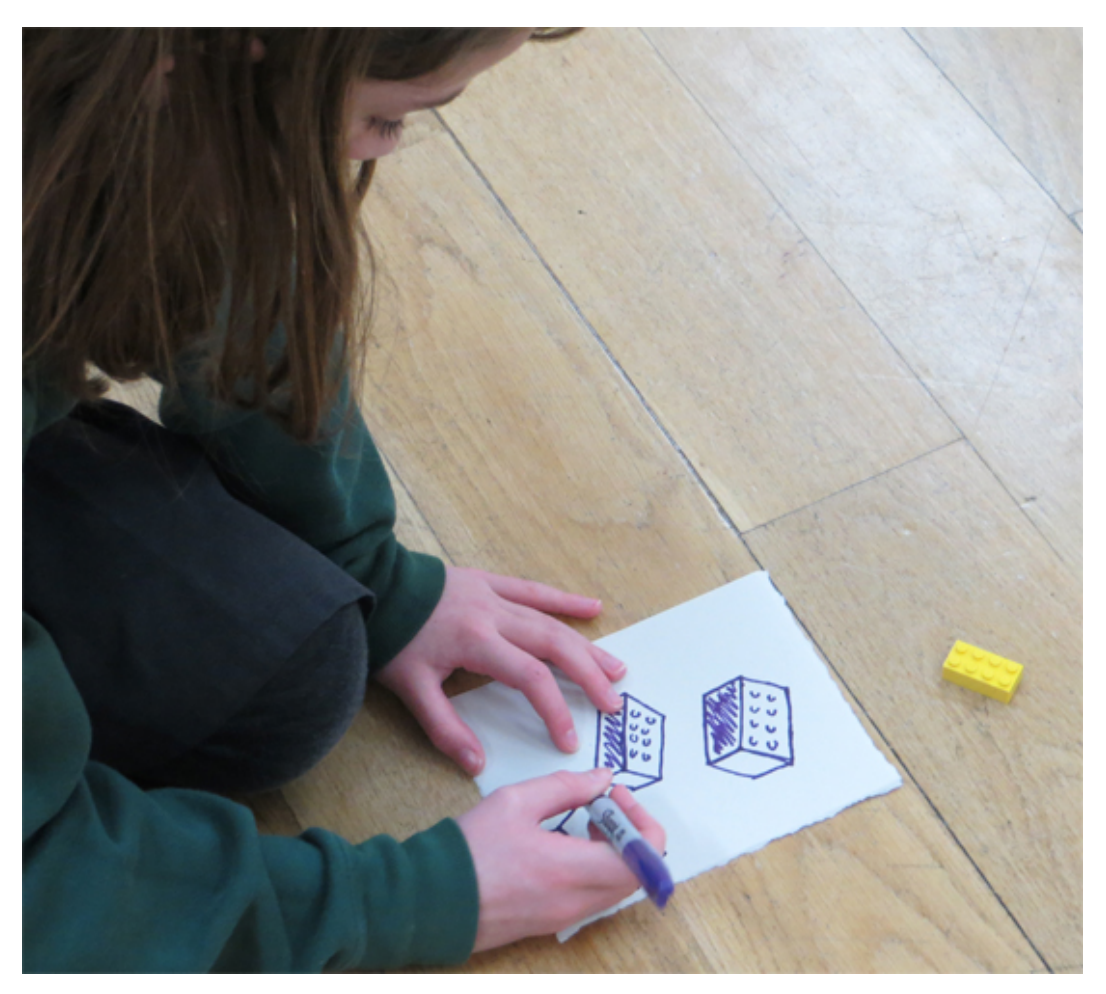
Thinking through perspective by drawing a Lego block