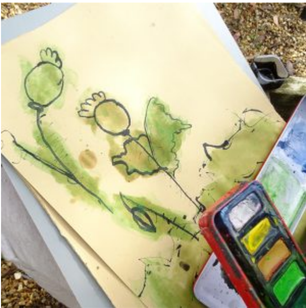
Drawing: Still Life