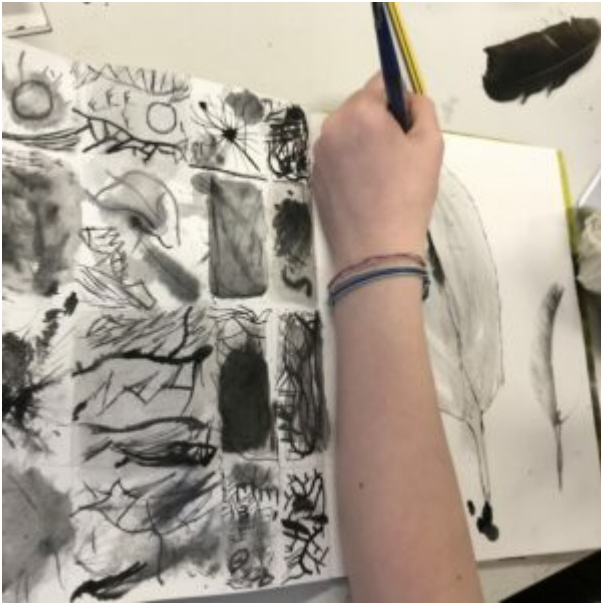
Drawing: Land & City Scapes