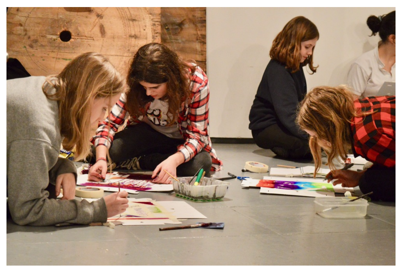
Schools, Colleges, Arts Organisations: Single and Multi-Users From £42

AccessArt is a UK Charity and we believe everyone has the right to be creative. AccessArt provides inspiration to help us all reach our creative potential.