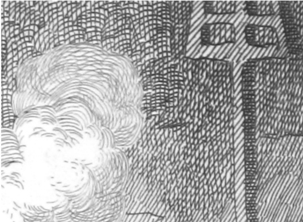
Detail of photocopied and enlarged engraving marks (taken from George Cruickshank's illustrations for Oliver by Charles Dickens)