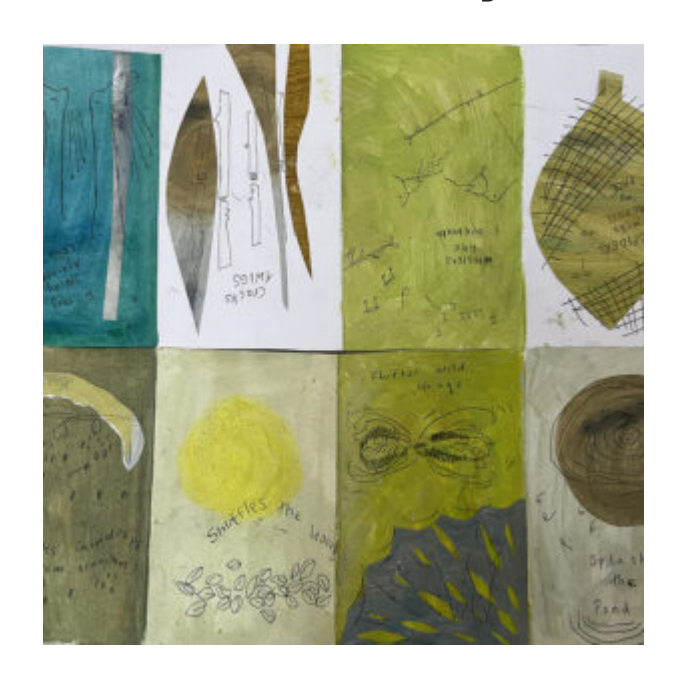
creating a poetry comic