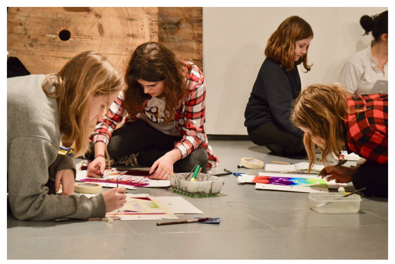
Schools, Colleges, Arts Organisations: Single and Multi-Users From £42

AccessArt is a UK Charity and we believe everyone has the right to be creative. AccessArt provides inspiration to help us all reach our creative potential.