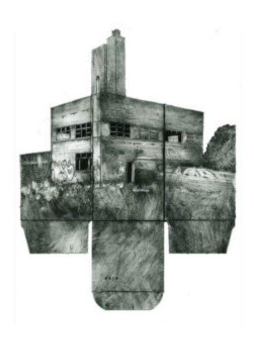
Printmaking Using Packaging