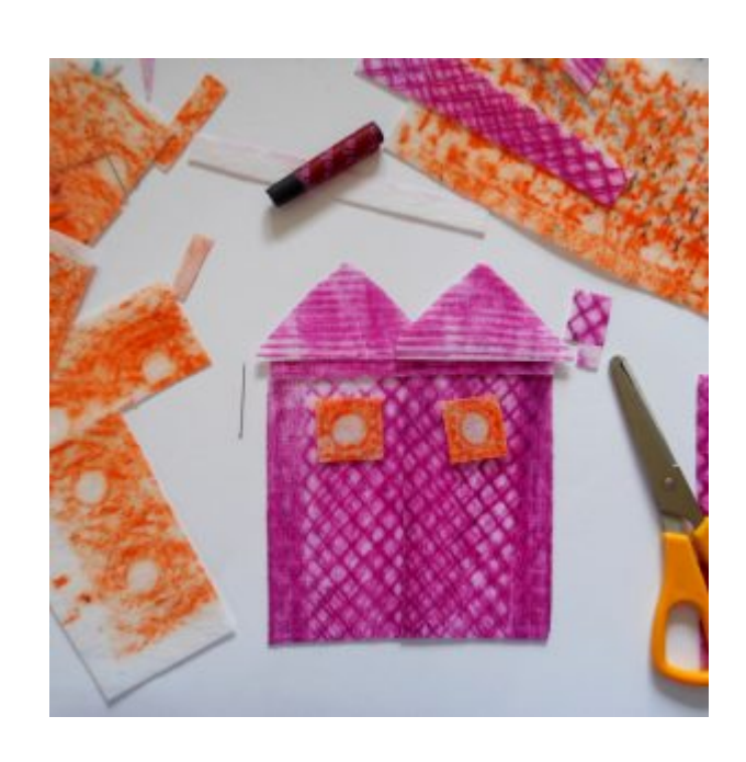
Mini World Light Boxes