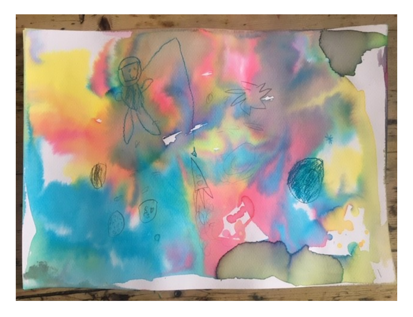
You can see more of Rachel's resources here.

This is a sample of a resource created by UK Charity AccessArt. We have over 1500 resources to help develop and inspire your creative thinking, practice and teaching.