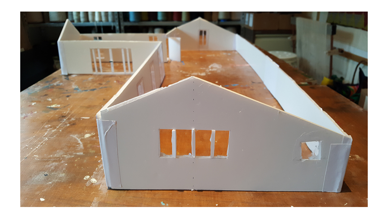
Making an architectural model of a gallery.