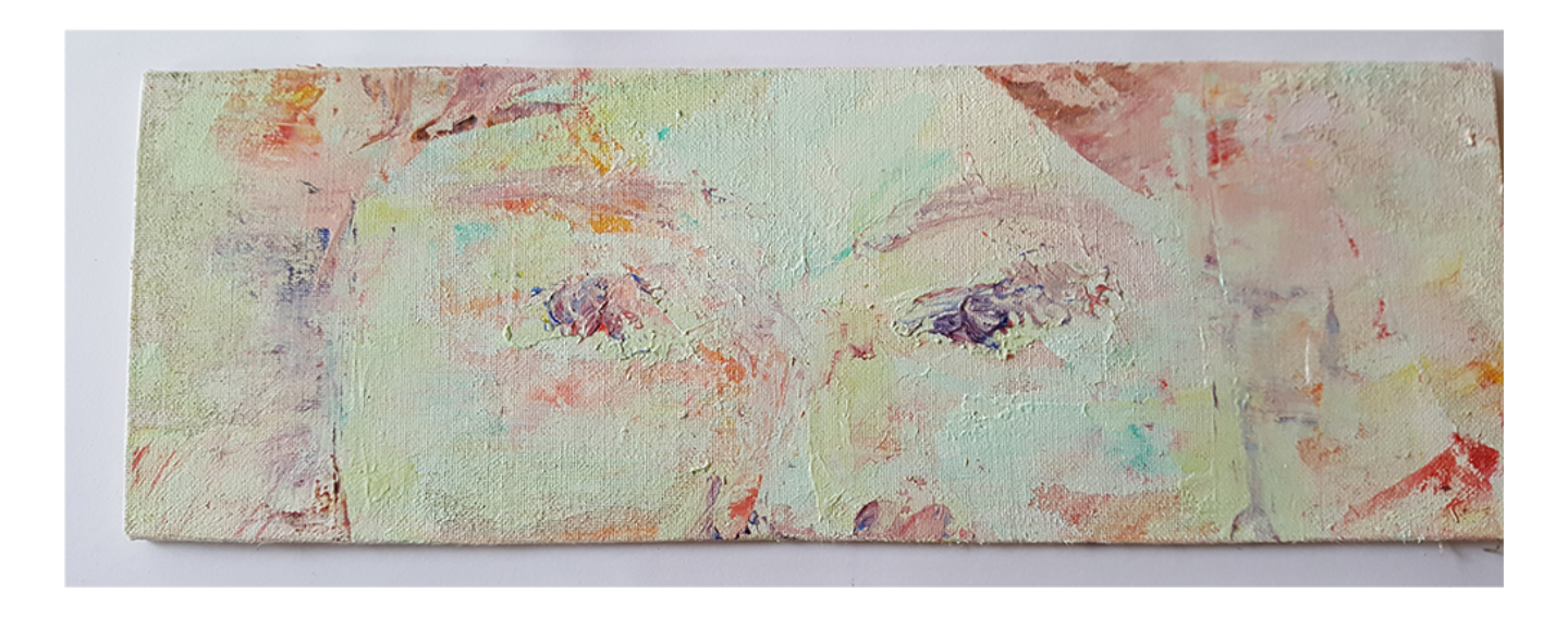
<u>Making miniature canvases.</u>

Installing Artwork in "To scale" gallery