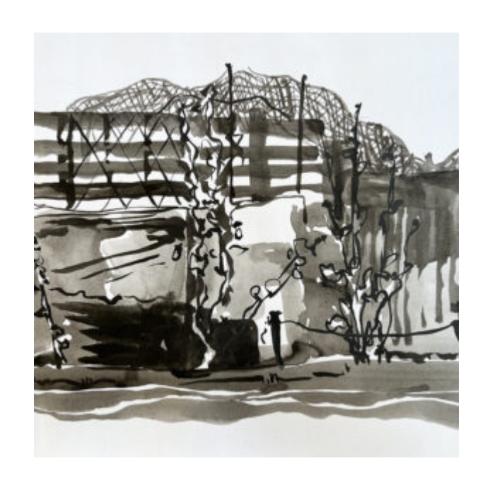
This is featured in the 'Mixed Media Land and City Scapes' pathway