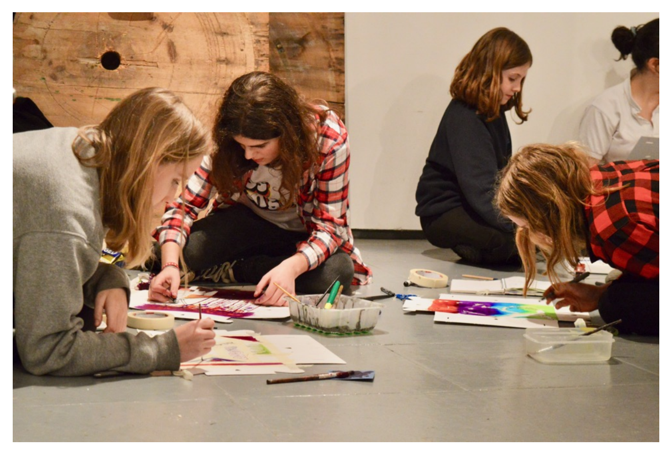
Schools, Colleges, Arts Organisations: Single and Multi-Users From £42

AccessArt is a UK Charity and we believe everyone has the right to be creative. AccessArt provides inspiration to help us all reach our creative potential.