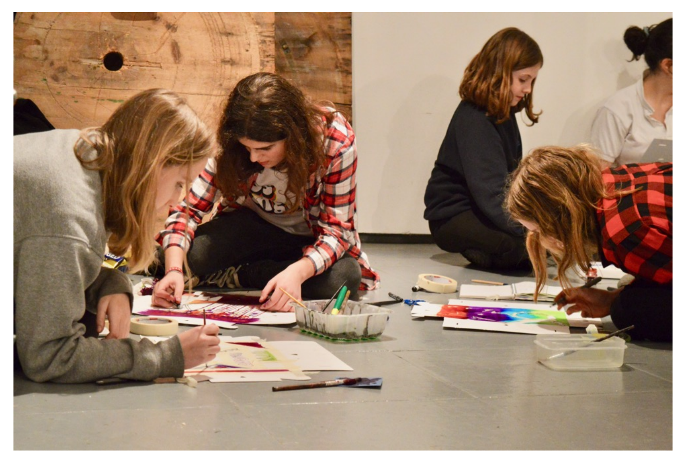
Schools, Colleges, Arts Organisations: Single and Multi-Users From £42

AccessArt is a UK Charity and we believe everyone has the right to be creative. AccessArt provides inspiration to help us all reach our creative potential.