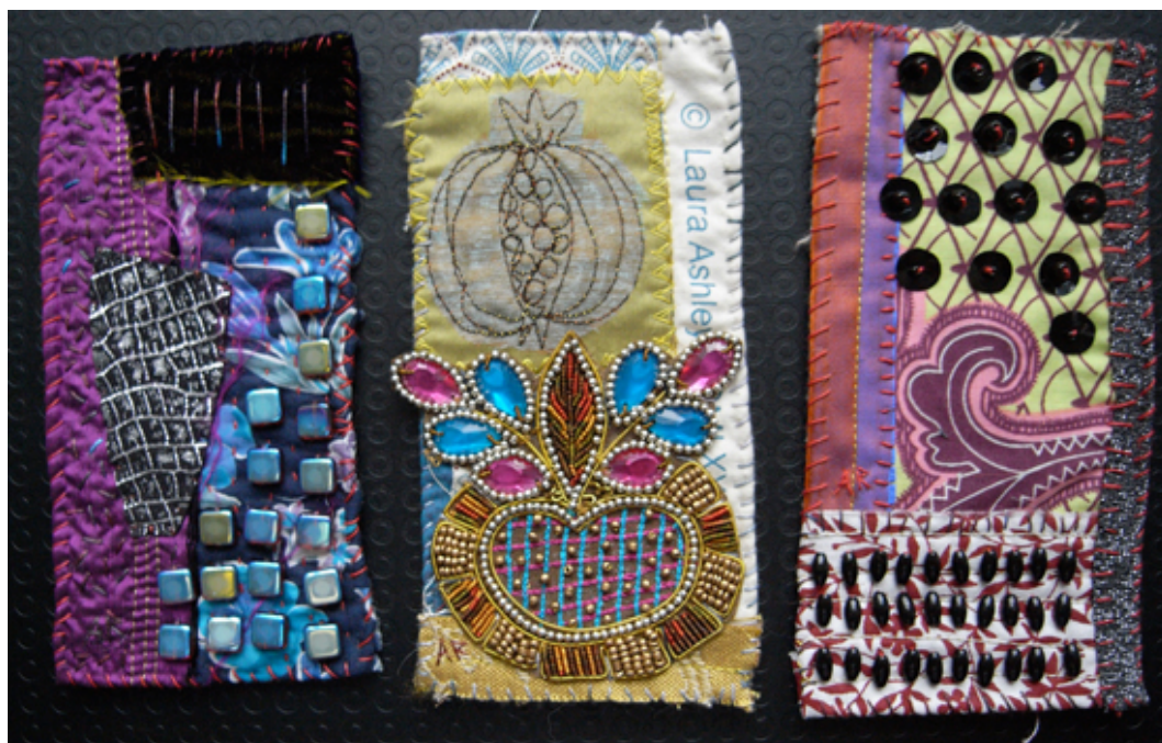
Laura Ashley Mini quilts

I tend to work in series about whatever company or topic I am working on. I find this a very useful way of slowing down my thinking, a bit like the Slow Cooking movement, so that I can let my ideas incubate for a while rather than dashing to get them onto paper. At the moment I am working on Laura Ashley and I have made a large quilt showing the importance of her 50p bit bags for a generation of British quilters, a series of mini quilts showing the preciousness of the fabric scraps, a series of narrative pieces of imagined lives of the women who wore the dresses, some Laura Ashley dolls and their husbands, dressed in Laura Ashley fabric showing the biographies of the women I have interviewed in fictionalised forms, and three dolls in vintage-looking dresses exploring the nostalgia in the brand.