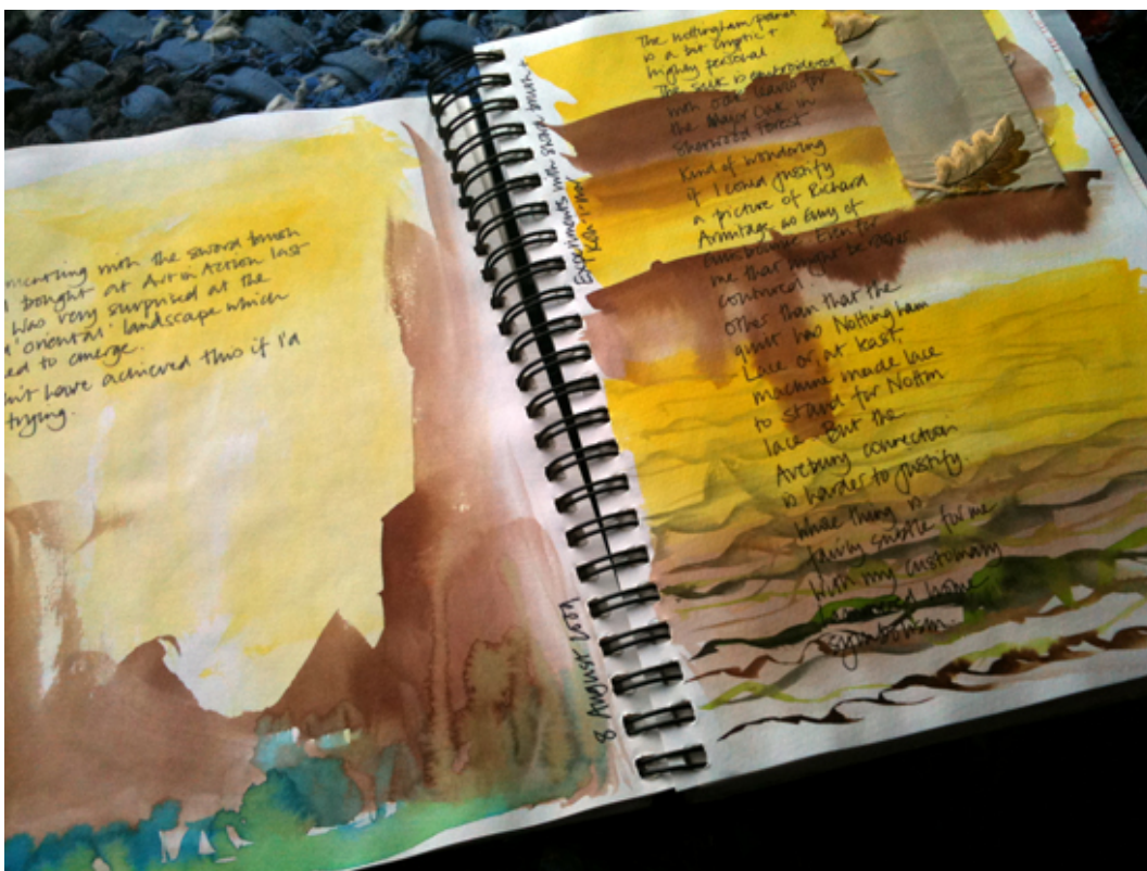
Body Shop sketchbook with 'found' landscapes.