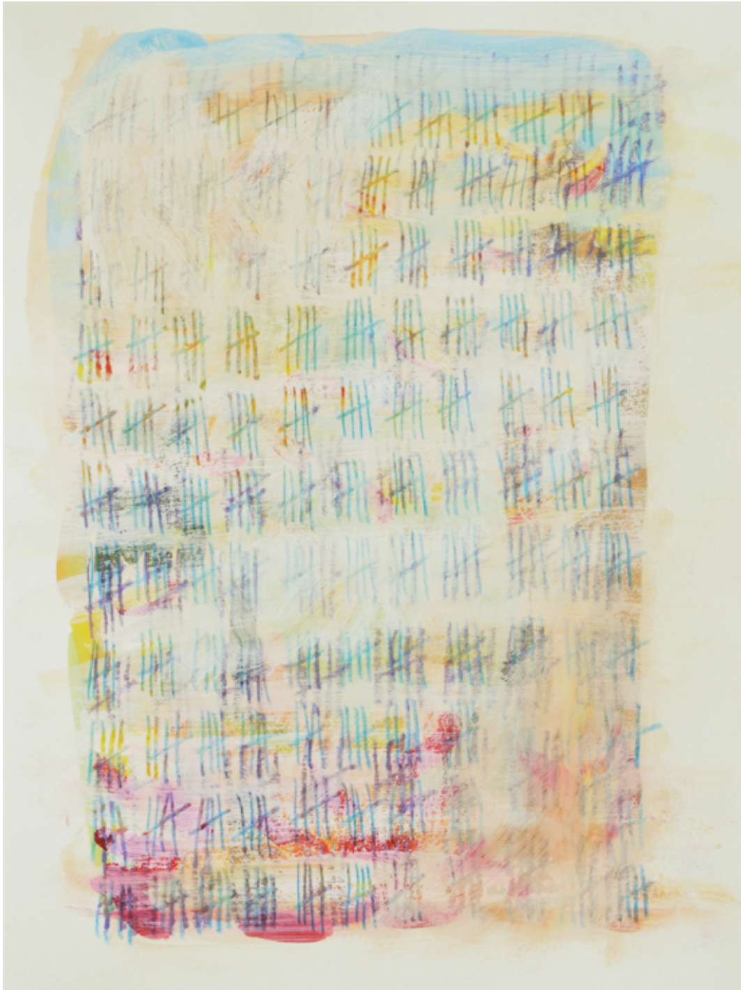
Autumn Tally by Sue Gough. Gouache, emulsion, coloured pencil on paper, 21.5 x 29.5 cm

The work is concerned with the cycle of life and the human condition. References to the landscape and the seasons provide the colours and textures, while the tally marks create the grids and structure.