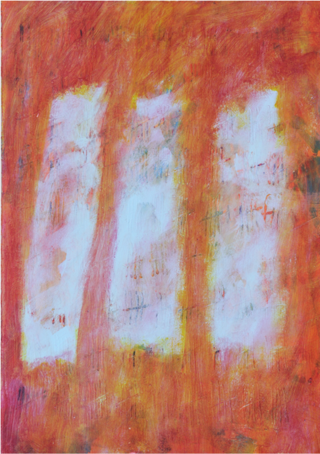
Autumn Study by Sue Gough. Gouache, emulsion, coloured pencil on paper, 21.5 x 30.5 cm

I am preparing to make a series of prints later this summer that will combine mono printing, collagraph and screen printing to produce some multi layered pieces and I am very much looking forward to spending some time exploring my ideas