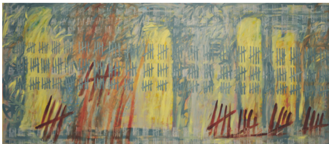
History Painting by Sue Gough. Acrylic on canvas, 405 x 174 cm

expressing my ideas within the theme, to keep my response flexible and fresh.