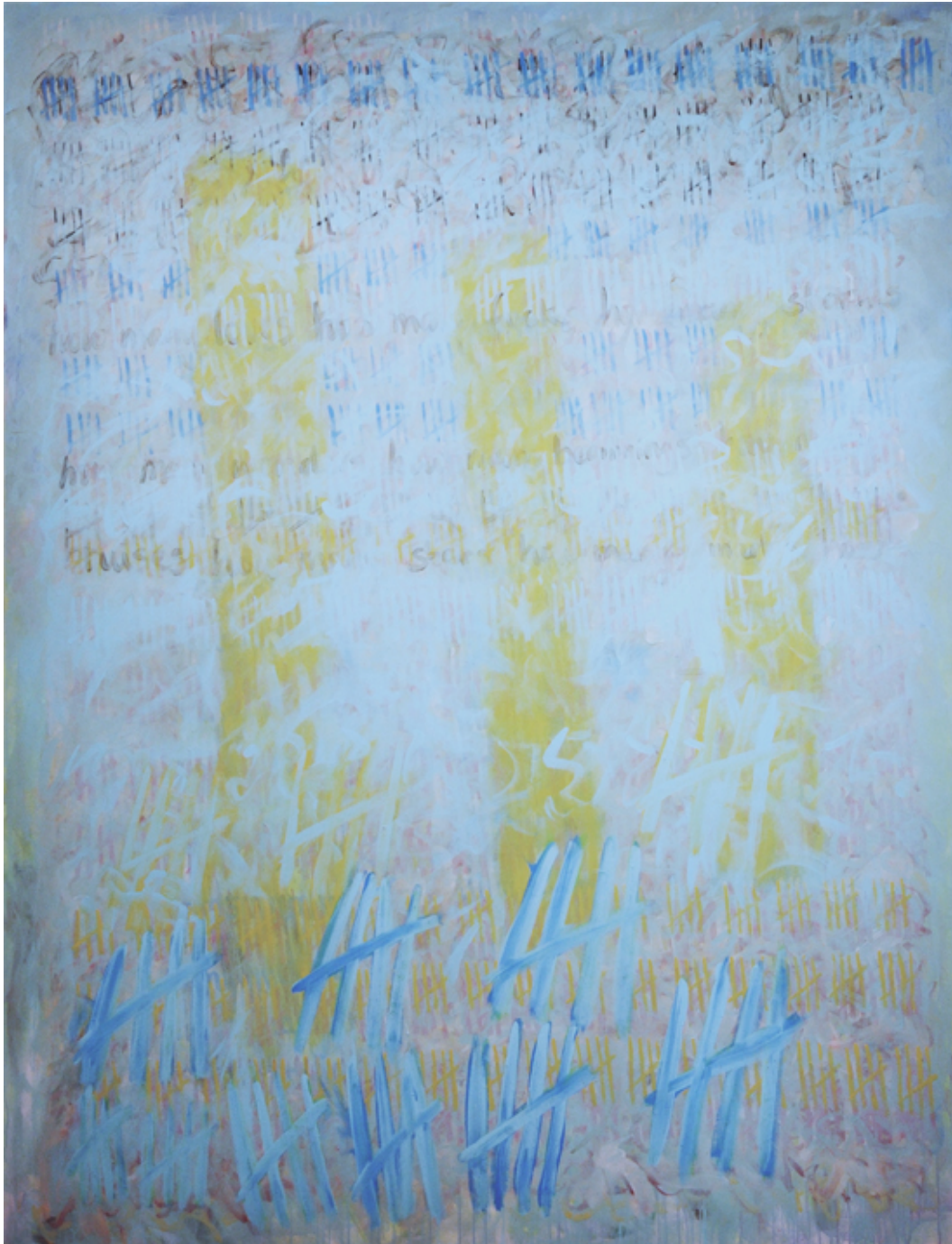
New Beginnings (Spring) by Sue Gough. Acrylic on canvas, 172 x 226.5 cm

work; the first ones were quite small, in a cheap sketchbook that I just happened to have to hand when I began and which I compulsively filled quite quickly. Since then, (the very end of 2011) I have continued to work on a variety of scales, on paper and in books, allowing myself to explore the theme, to see where it can take me and where I can take it.