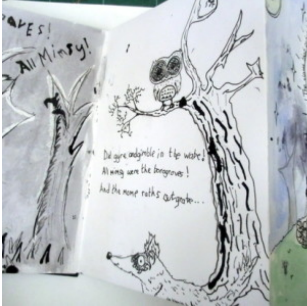
Illustration is a form of visual communication used to interpret and represent narratives or concepts. It is a versatile discipline that can be used across printed materials, such as books and newspapers, to either complement or replace text.

It can also be used for decorative purposes across other art forms, such as surface design or ceramics.