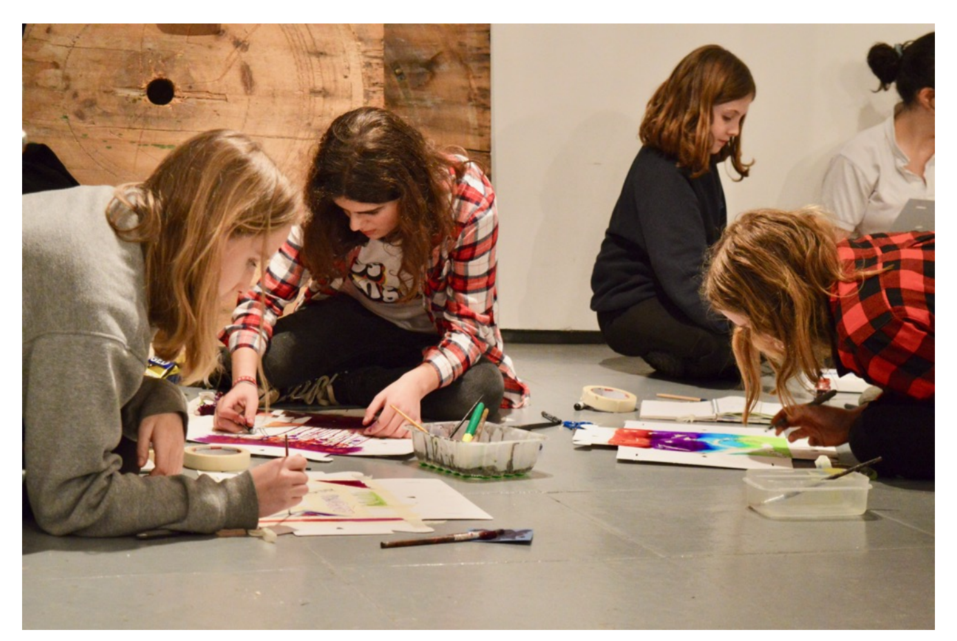
Schools, Colleges, Arts Organisations: Single and Multi-Users From £42

AccessArt is a UK Charity and we believe everyone has the right to be creative. AccessArt provides inspiration to help us all reach our creative potential.