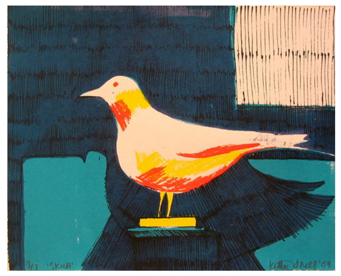
Skua; screenprint, 25 x 29cm