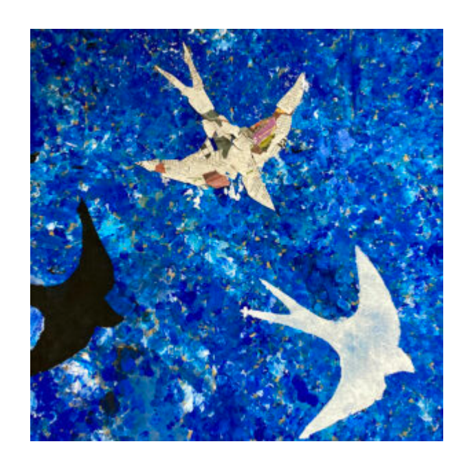
Birds in trees