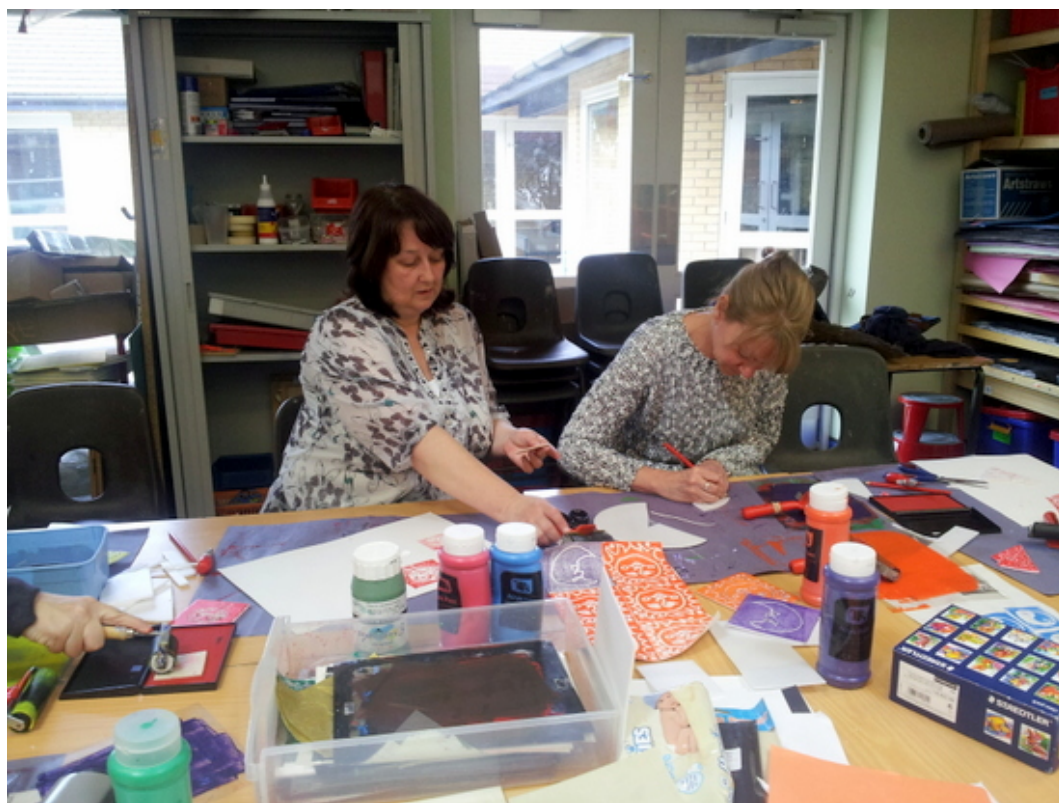
Introducing Printmaking to teachers at Samuel Pepys Special School

Download the full AccessArt Inset PDF here