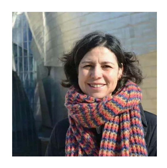
Sheila Ceccarelli AccessArt Infographic