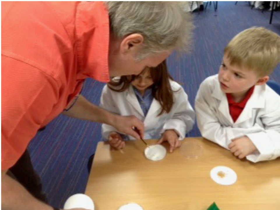
We used seeds and placed them on wet pads in sealed Petri dishes.

We then placed the seeds into different coloured bags – clear, blue, green, red and in tin foil (no light).