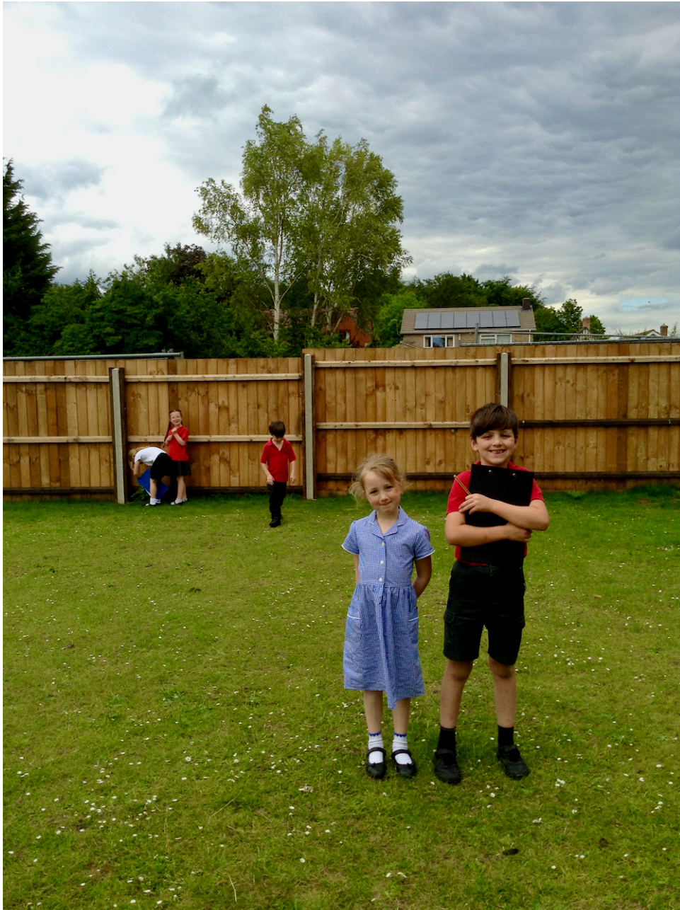
There is a silver birch behind us!