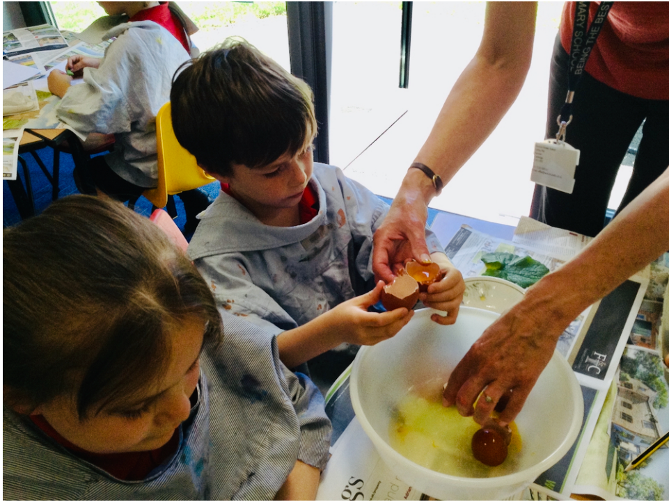
I love using egg and wine!