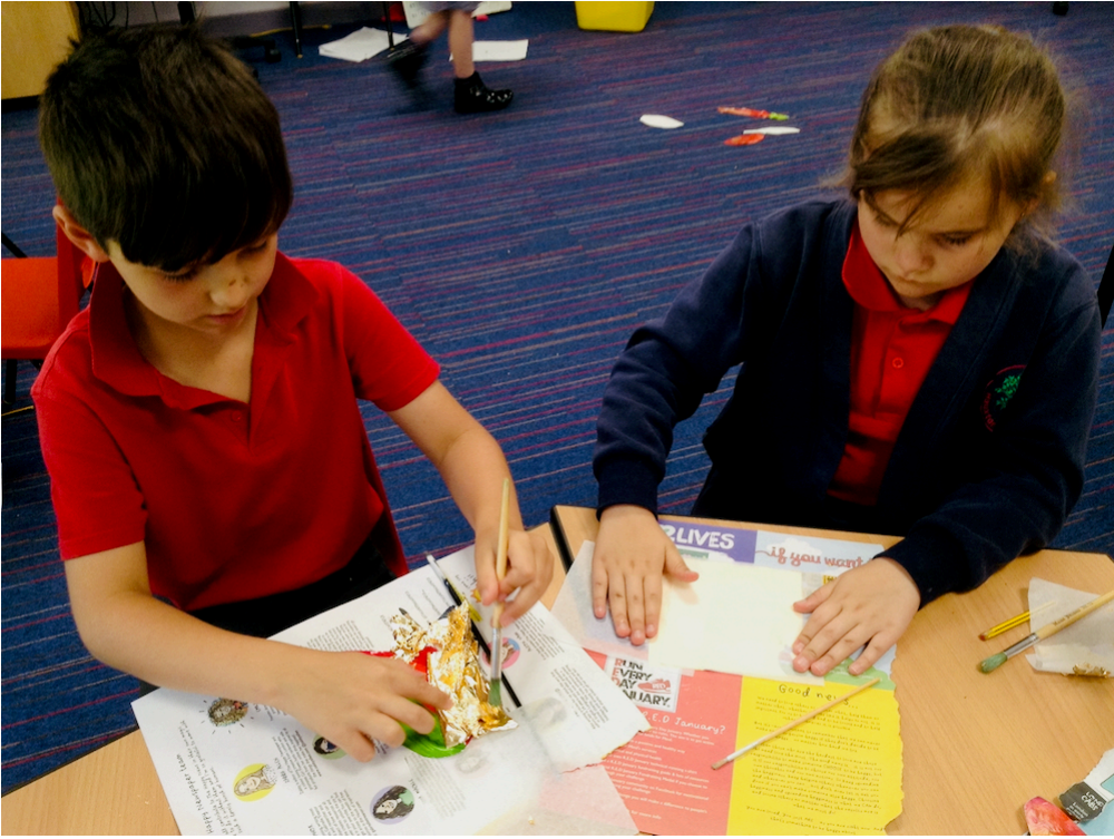
'The Tree' by Owl Class