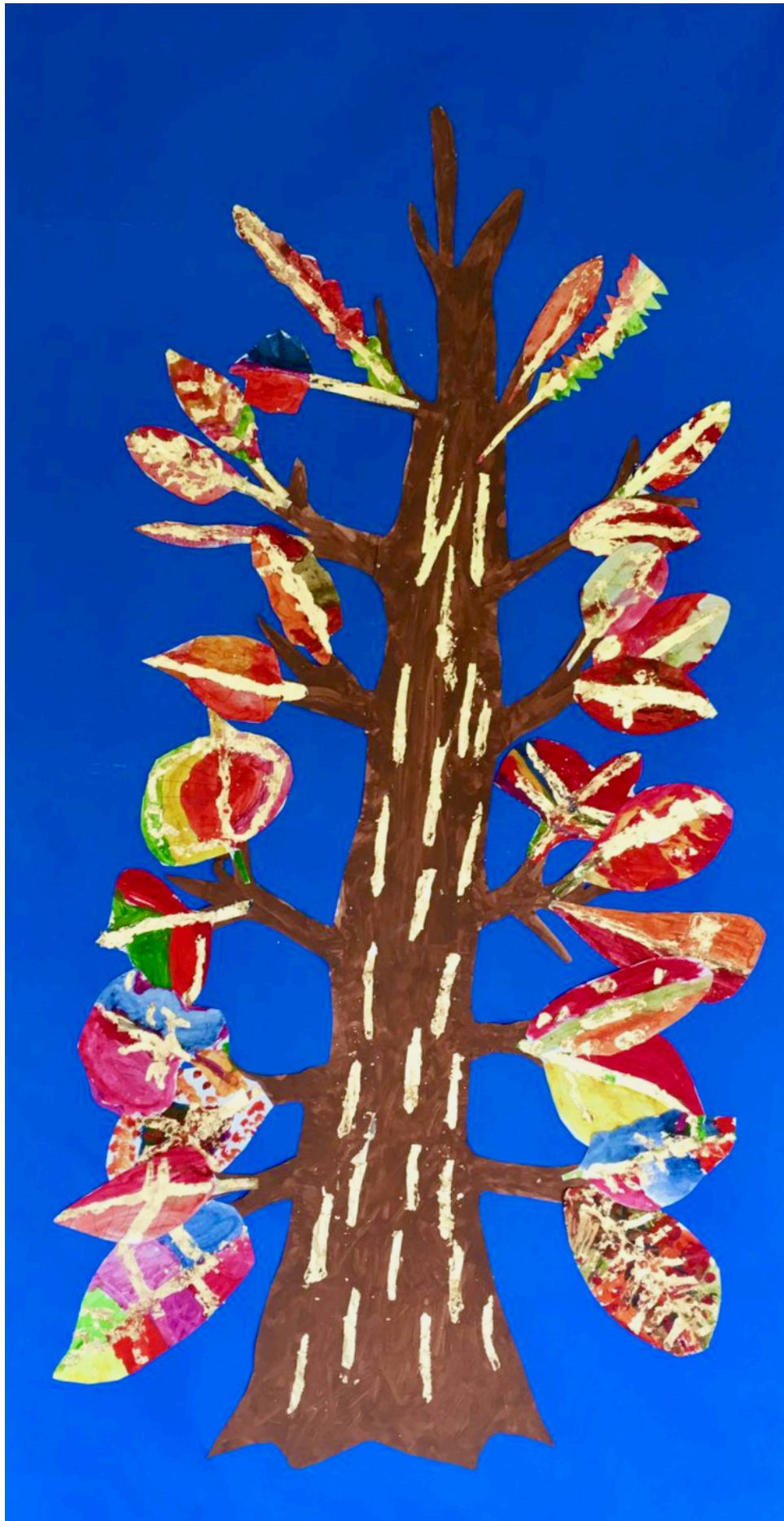
'The Tree' by the Owl Class, Year One and Two at Hauxton Primary School, Cambridgeshire