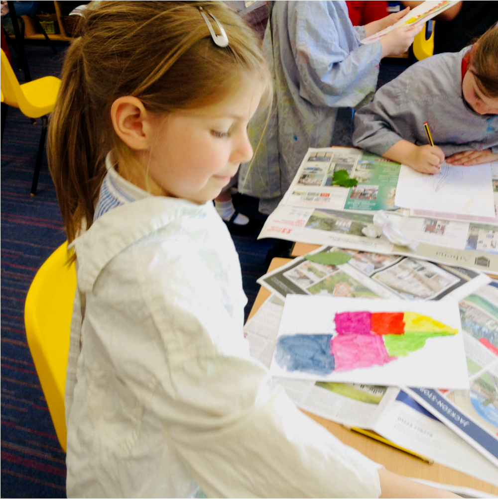
Gilding our leaves