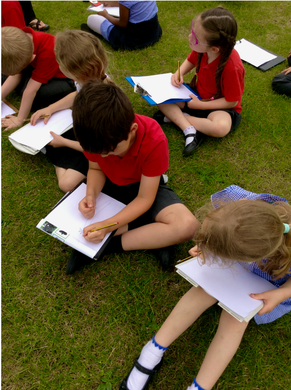
We looked at and drew trees!