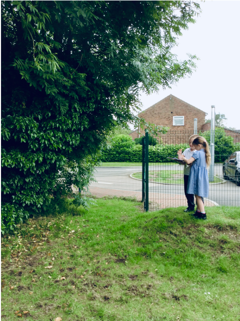
We went outside to look at trees and their leaves.