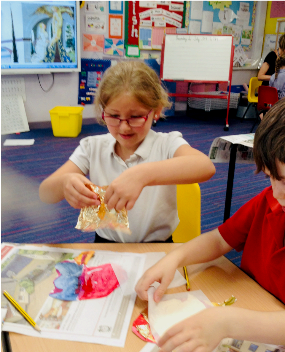
We used gold leaf to gild our leaves.