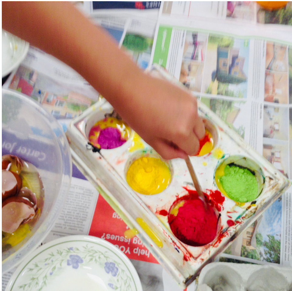
We mixed powder paint with egg and wine!